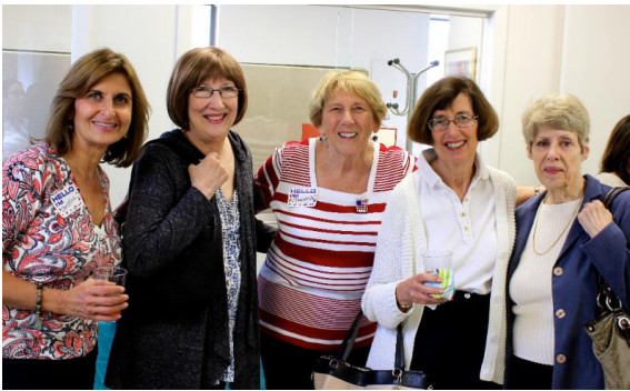
LS Tutors gathered at Open House. Many of us met for the first time, but it's like we've known each other forever!

10:30am - noon Come learn what is involved in tutoring a student toward citizenship goals!